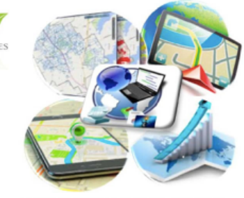
Information Driven with Cutting Edge Technology for Sustainable Solutions...

Cell: +27 73 321 5159 Tel: +27 64 014 0419