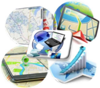
Information Driven with Cutting Edge Technology for Sustainable Solutions...

Cell: +27 73 321 5159 Tel: +27 64 014 0419