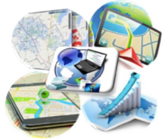
Information Driven with Cutting Edge Technology for Sustainable Solutions...

Cell: +27 73 321 5159 Tel: +27 64 014 0419